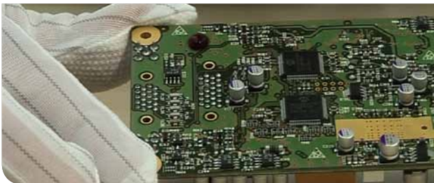
PCB protection: 3M Novec Surface Modifier coated on a PCB protects the component from corrosion which can result in malfunctions and costly repairs.