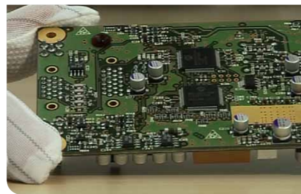
Printed circuit board coated with 3M Novec Surface Modifier

We understand that in choosing the right coating solution you require support to ensure you are using the best possible solution which meets your needs. To help answer any of your coating questions we have created a forum on our Novec Coating website where Mark will be able to support you directly.